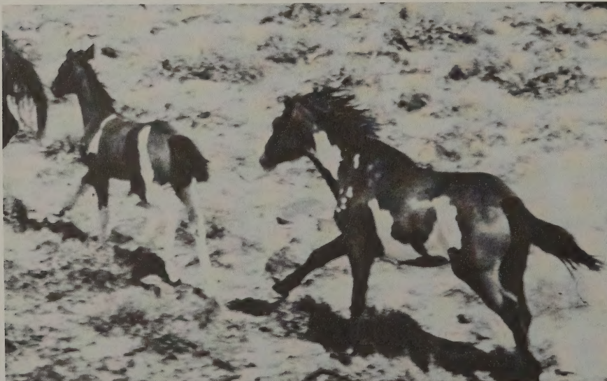
Although not a common sight, some of today's wild horses exhibit the pinto markings generally associated with Indian horses of yesteryear.

By the time the settlers reached the Plains, mounted Indian warriors had earned the distinction of